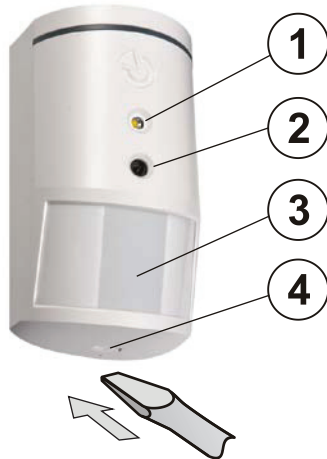
Figure: 1 – flash for illumination; 2 – camera lens; 3 – PIR detector lens; 4 – cover tab;

The detector can be installed onto a wall or in the corner of a room. There should be no obstacles which quickly change temperature (electric heaters, gas appliances, etc.) or which move (e.g. curtains hanging above a radiator) or pets in the detector's field of sight. It is not recommended to install the detector opposite to windows or floodlights or in places with over-intense air circulation (close to ventilators, heat sources, air conditioning outlets, unsealed doors, etc.). There should be no obstacles in front of the detector which might obstruct its view.